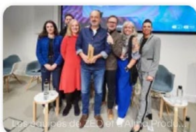
Les équipes de ZED et Alma Produ...

Le documentaire, qui s'appuie sur « récentes découvertes archéologiques », « explore l'incroyable héritage architectural de Caligula, défiant toutes les perceptions simplistes et caricaturales de cet empereur controversé ». Il intègre de la modélisation 3D et donne la parole à des experts.