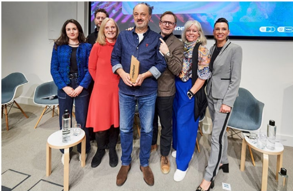
ZED team

news@senalnews.com @senalnews f @senalnews in @senalnews